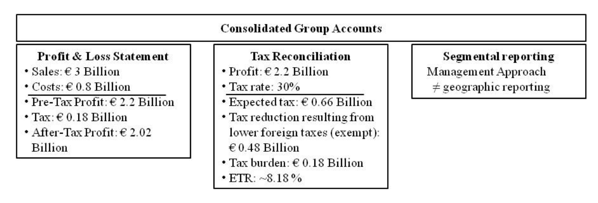
Figure 4: Intra-group profit shifting and consolidated financial accounts

Most importantly, consolidated financial statements are supposed to provide decision useful information about a group of companies as a single economic entity. Therefore, intra-group transactions are consolidated and, thus, do not affect the overall profit. As the example shows, profit shifting activities by means of intra-group transactions are not visible in consolidated financial statements. This is due to the netting out of profits and expenses within the group (in our example: royalty income of IP-Holding and payments of Subsidiary of €1.9 billion) and the aggregation of total tax payments (see Figure 4).