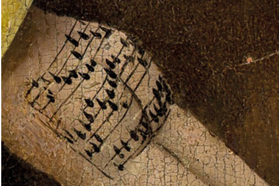
Fig 1: The “Bottom Book of Music”. Hieronymus Bosch, The Garden of Earthly Delights (Detail).

The first case study is deliberately provocative and begins in the comic mode: The depiction of a body inscribed with a musical score on the buttocks.