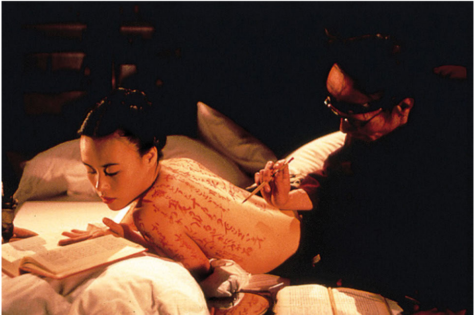
Fig. 5: Nagiko being inscribed by her husband the calligrapher, from: The Pillowbook , A film by Peter Greenaway, 1996.

The publisher, who had originally refused to accept Nagiko’s work, finds pleasure both in Nagiko’s first book, and in reading it from Jerome’s body. He licks the writing and tastes the flesh that bears it. The act of deciphering the text is also that of discovering the body of its bearer, and he and Jerome become lovers.