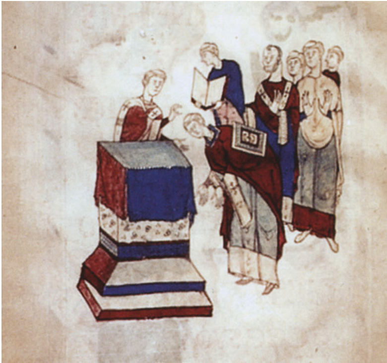
Fig. 4: Impositio Evangeliorum . Ordination of Pope Sylvester II in the Warmund-Sakramentary (Detail), Bibliotheca Capitulare Ivrea , cod. LXXXVI, fol. 8r (Mariaux 2002, Planche 4).

The image of the text of the gospel laid open on the back of the future bishop of Rome is quite remarkable, and remained confined to the ordination of the popes. 24 Engels mentions a letter by Pope Urban II from the late 11 th cent. where he discusses the implications of onction and points out the difference between forma and virtus sacramenti . Whereas virtus might get lost, in case the ordained leaves the community of the church, the forma of a sacrament, he says, functions like a seal, once imprinted on the body it stays with its bearer for ever and enables him to exercise spiritual power. The gospelbook imposed on the candidate might be best compared to a seal, impressed onto the pope’s body as writing material for the continuation of God’s salvific history with humankind. 25 I even found a depiction of exactly this element in the ordo , namely in the Sacramentary of Warmundus of Ivrea, drawn up around the year 1000.