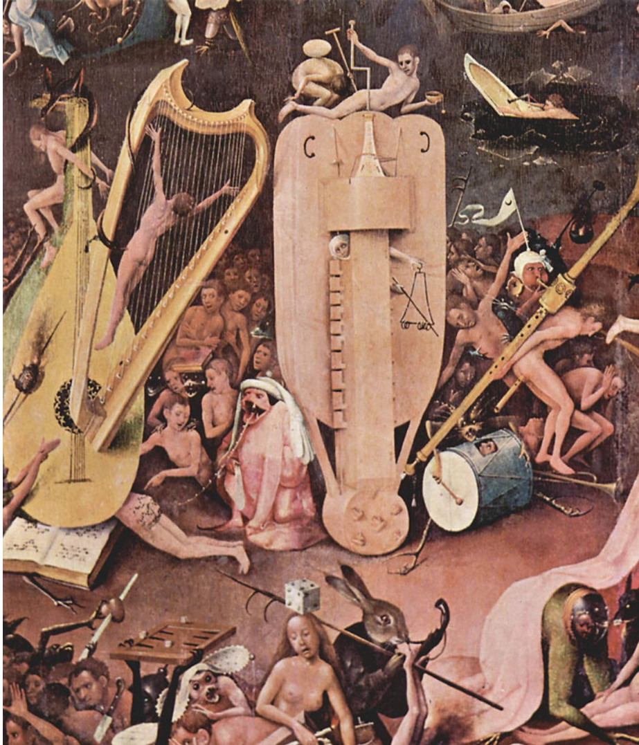
Fig 2: The Garden of Earthly Delights by Hieronymus Bosch (Detail from the left wing of the triptych).

Belting and others have pointed to the fact that this kind of musical torture has no precedent in literature. This fact, however, should not distract from the apparent modelling of the tortures of hell here depicted on the crucifixion of Christ, a crucifixion in the comic mode, with the typical instruments of the Arma Christi. 11 Three men