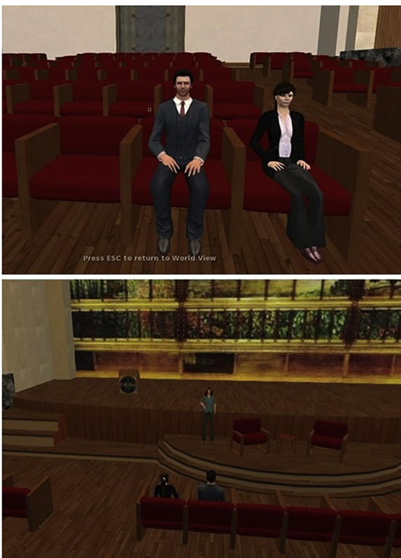
Fig. 1. The virtual TSST paradigm.

Childhood rearing experiences were measured with two questionnaires in order to increase accurateness of the early rearing environment. First, we assessed an insensitive disciplinary parenting strategy; maternal use of love withdrawal. This strategy involves withholding love and affection when a child misbehaves. Maternal use of love withdrawal was measured by an 11-item questionnaire which combines seven items of the Withdrawal of Relations subscale of the Children's Report of Parental Behavior Inventory (Beyers and Goossens, 2003) and four items from the Parental Discipline Questionnaire (Hoffman and Saltzstein, 1967). Participants rated how well each statement described their mother (e.g., "My mother is a person who, when I disappoint her, tells me how sad I make her") on a 5-point scale. This 11-item questionnaire has been used in previous studies showing that love withdrawal moderates oxytocin effects (Huffmeijer et al., 2012; Riem et al., 2013a, 2013b). Internal consistency was good