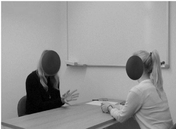
Fig. 1 Experimental set-up

( candidate does not comply with the quality requirements ) to 4 ( candidate fully complies with the quality requirements ). After an intensive coder training, three independent raters coded the material (156 videos in total; about 10 minutes per video). Around 50% of the material (82 videos) was rated by two different coders, in order to ensure these high-inference ratings were as objective as possible. We use Spearman's rank correlation as measures of interrater reliability, which is recommended for ratings (Wirtz and Caspar 2002). The results showed satisfying to sufficient agreement for each aspect ( Content : .79; Student-teacher interaction : .65; Process structure : .62; Representation : .60; Language : .69; see Field 2011, p. 170). We used the mean of all five quality aspects as a measure of teacher candidates' explaining skills (overall quality of explanation).