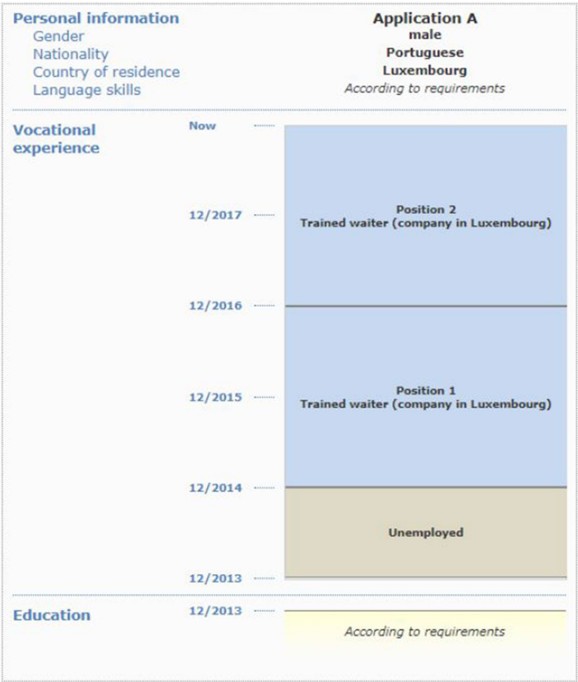
Fig. 1 Example vignette

FSEs have become an established method for studying how recruiters shortlist applicants for a given job (McDonald 2019). The method employs fictitious descriptions of situations, persons, or objects, which are evaluated sequentially by respondents. These descriptions (called ‘vignettes’) comprise multiple dimensions and levels that are experimentally manipulated