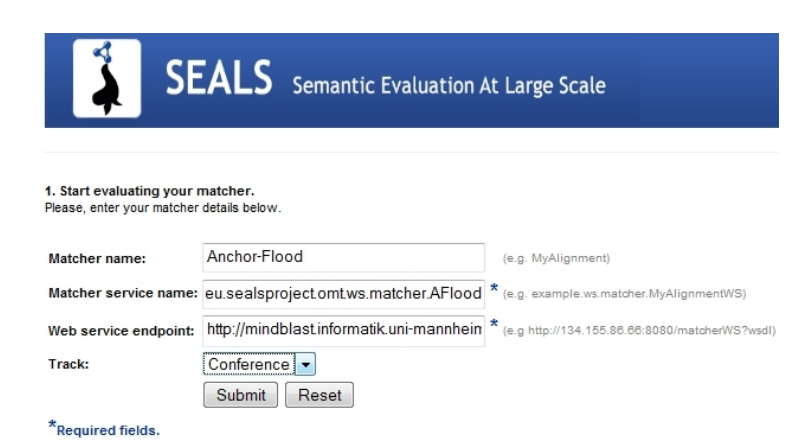
Fig. 2. Specifying a matcher endpoint as evaluation target.