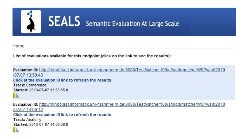
Fig. 3. Listing of available evaluation results.

The user can visualize the results in an OLAP application by clicking on the plot figure in Figure 3, in a similar way from what is shown in Figure 6, but in a setting where only the results of his/her system are shown. Furthermore, organizers have a similar tool for accessing the results registered for the campaign as well as all evaluations being carried out in the evaluation service (even the evaluation executed for testing purposes).