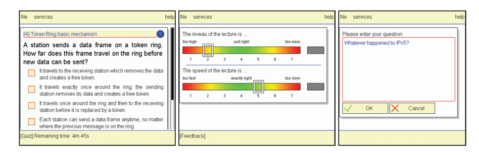
Figure 3: Screenshot of the students' client showing a quiz, feedback and call-in