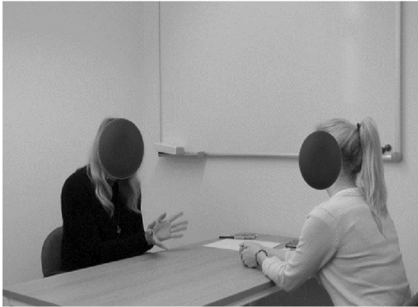
Fig. 1 Experimental set-up

( candidate does not comply with the quality requirements ) to 4 ( candidate fully complies with the quality requirements ). After an intensive coder training, three independent raters coded the material (156 videos in total; about 10 minutes per video). Around 50% of the material (82 videos) was rated by two different coders, in order to ensure these high-inference ratings were as objective as possible. We use Spearman's rank correlation as measures of interrater reliability, which is recommended for ratings (Wirtz and Caspar 2002). The results showed satisfying to sufficient agreement for each aspect ( Content : .79; Student-teacher interaction : .65; Process structure : .62; Representation : .60; Language : .69; see Field 2011, p. 170). We used the mean of all five quality aspects as a measure of teacher candidates' explaining skills (overall quality of explanation).