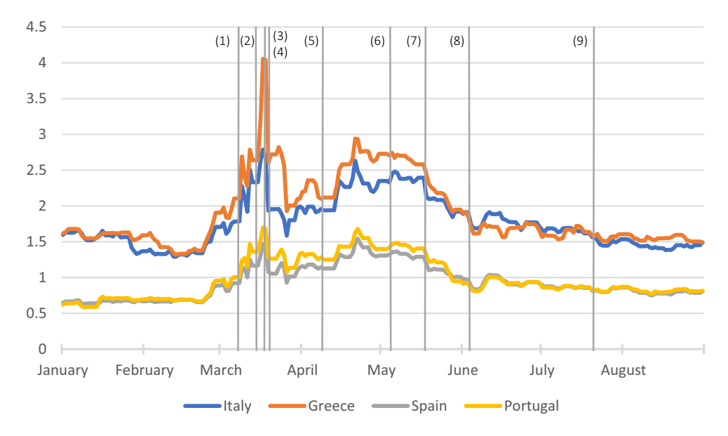
FIGURE 2 Selected Eurozone sovereign debt spread (in%). Source: Bloomberg. Spreads are reported as compared to yields on German bonds. List of events: (1) Italian nationwide lockdown. (2) German border closure. (3) ECB PEPP. (4) Suspension of the SGP. (5) ESM PCS facility. (6) German constitutional court ruling. (7) French-German initiative for cross-country transfers. (8) ECB PEPP increased. (9) EU Council Agreement on Next Generation EU

Source: Bruegel dataset as of June 23, 2020. Notes: Discretionary 2020 fiscal measures adopted in response to COVID-19, in % of 2019 GDP. Immediate fiscal impulses are additional expenses and foregone tax income that lead to an irreversible deterioration of the fiscal balance. Deferral are measures reporting tax collections. Liquidity provisions and guarantees are contingent liabilities that might materialize into actual expenses.