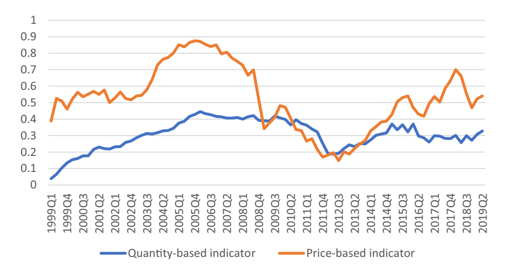
FIGURE 1 Eurozone financial integration indicators. Notes: The index of financial integration is based on price co-movements of asset classes and portfolio diversification across countries. Indicators range from 0 (no integration) to 1 (full integration). Details in Hoffman et al. (2019)

The COVID-19 pandemic is exacerbating this economic divide.Projections for 2020 (reported in Table 1) outline the increasing heterogeneity of the monetary union. This is the result of three main developments. First, as documented in this issue, from a health perspective, the impact of the pandemic