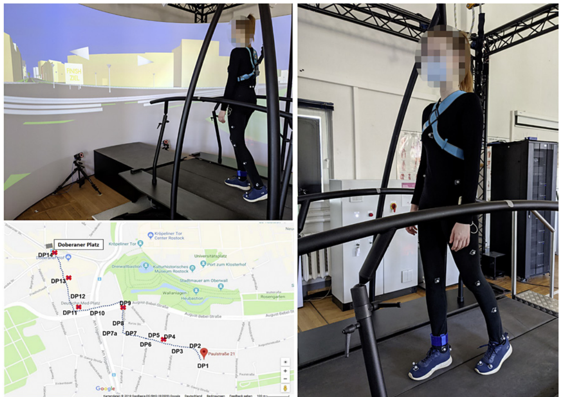
Fig. 1. Depiction of the experimental setup (top left and right). Image is used with permission of the participant. Wayfinding route (bottom left). Red crosses denote locations where the VE was manipulated in the experimental group. DP1 to DP14 indicate the DPs from start to finish. The changes as described earlier were always the same for all older participants in the experimental group.

or present unstable medical conditions, major psychiatric disorders or neurological diseases, and musculoskeletal injuries. All participants had either normal or corrected-to-normal vision. Table 1 shows the demographic characteristics of the participants. All volunteers were informed about the experimental procedures and possible risks associated with the experiment before giving their written consent. The study followed the guideline of the Declaration of Helsinki [28], and was approved by the Ethics Committee of the University Medicine Rostock (Approval number: A 2019-0062).