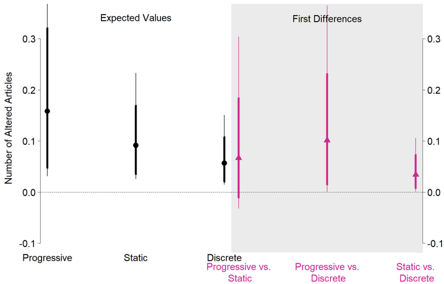
Figure 2. The effect of political ambition on legislative review, based on Model 3. Dots show the mean expected number of submitted article changes for members of each ambition category. Triangles show the mean differences in expected article changes between the three categories. Values are based on 10,000 draws from a multivariate normal distribution defined by the vector of parameter estimates reported in Model 3 and their covariance matrix. Thick bars display the 8.3 per cent and 91.6 per cent (thin 2.5 per cent and 97.5 per cent) quantiles of the simulated distributions. [Colour figure can be viewed at wileyonlinelibrary.com ]

likelihood of holding higher office in the future. This is robust evidence for a positive impact of legislative activity on promotion.