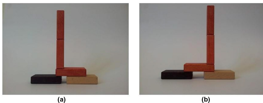
FIGURE 2 Example items of the COM test (a: unstable, b: stable).

Note: Preschool teachers' PCK was measured on a 4-point Likert scale (1 = do not agree at all and 4 = totally agree).