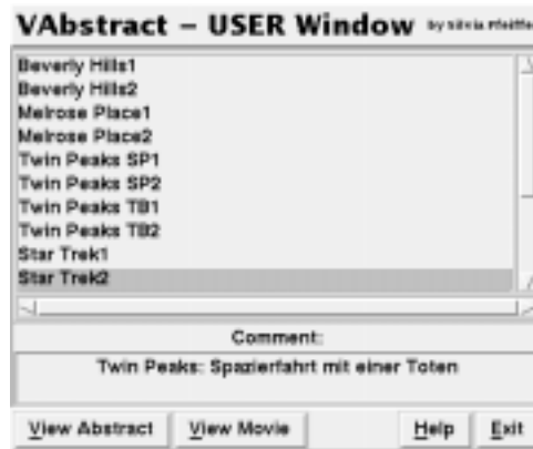
Figure 2: User Interface for VAbstract

VAbstract was implemented in about 1500 lines of ANSI C using the Vista library V2.1.3 [PKL95] [PL95]. The audio modules are currently still missing. Title extraction must be done by hand, but we are close to an automatic solution [LS96].